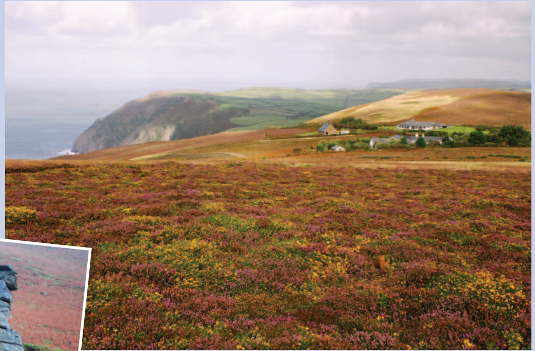
Above: View from Holdstone Hill