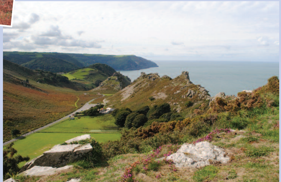
Left: Looking up the Punch Bowl